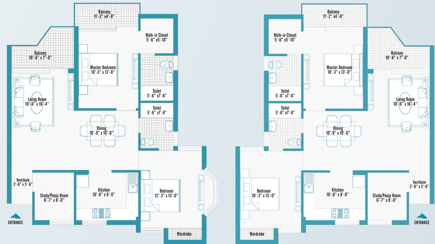
2 BHK CORNER 1285 Sq. Ft.